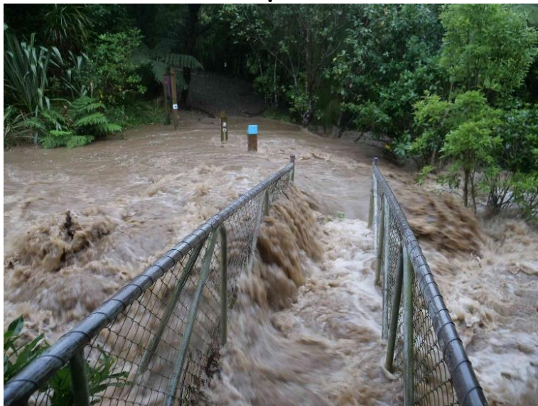
Left: Bridge 6