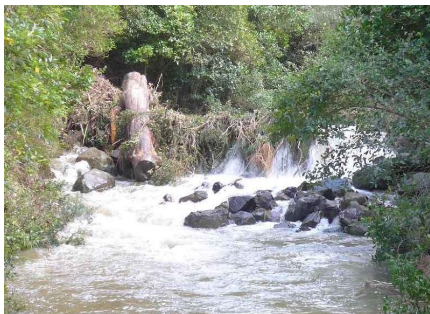
Debris trap after the 17 July flood, later cleared by Wellington Water

Despite periodic flooding mayhem over the years, somehow native fish, eels, and invertebrates remain. But it was so bad on 17 July, one wonders how could they not all be swept away? Time will tell.