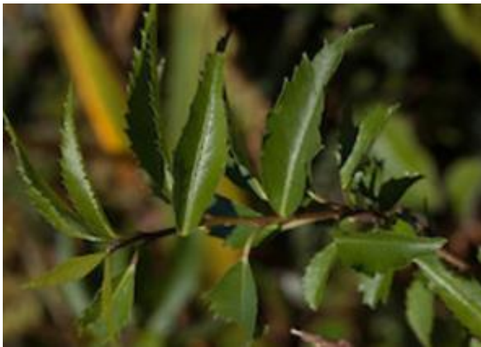
H. sextylosa has a narrower/thinner leaf, deeper serrations and has a slightly divaricating stage, (filiramulate) when young. Any shoot off the base of a trunk will revert to the filiramulate stage. Adult plants are much taller and have a weeping form.