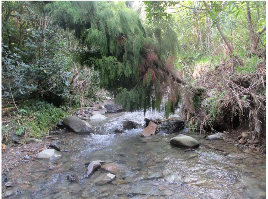
Rimu downstream of bridge 3

We are mourning the possible loss of the best of the rimu we planted in 2006 – another legacy of the 17 July flood. Originally, we thought of re-planting further back, but WCC's Anita Benbrook says, "It's probably best to try and winch it upright using a turfer winch and securing it back upright. It may survive but rimu don't usually survive mass root disturbance so there would be little point in digging it right out and moving it. Building up the corner of the bank with stones may be an option?"