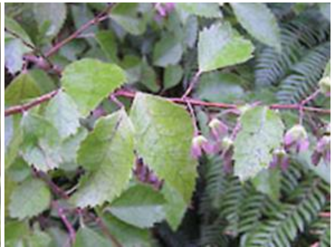
H. populnea has a wider leaf, fewer serrations, and a slightly purple back to the leaf.