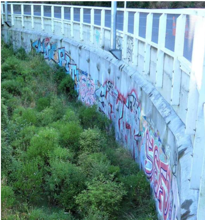
Midway up Ngaio Gorge Road – soon to be concealed by the planting.

For the connoisseur, the lower Kaiwharawhara valley is unrivalled. Here are two fine examples: