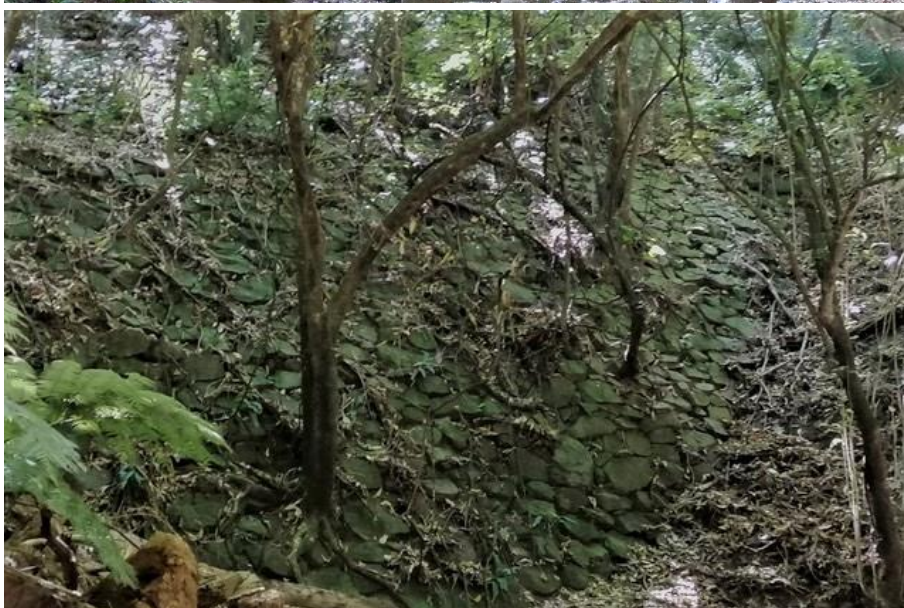
Note the old stone lining to reinforce the side of the embankment.

Does anyone have any history of this area?